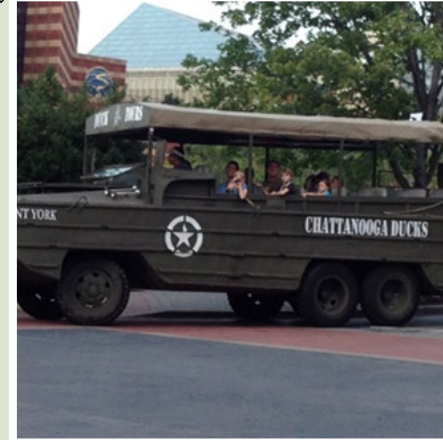
Expanded Economic Opportunity