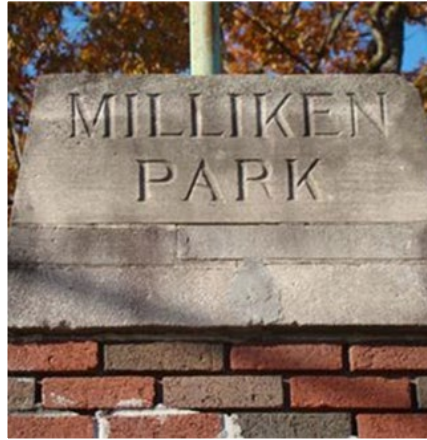
Suitable Living Environment