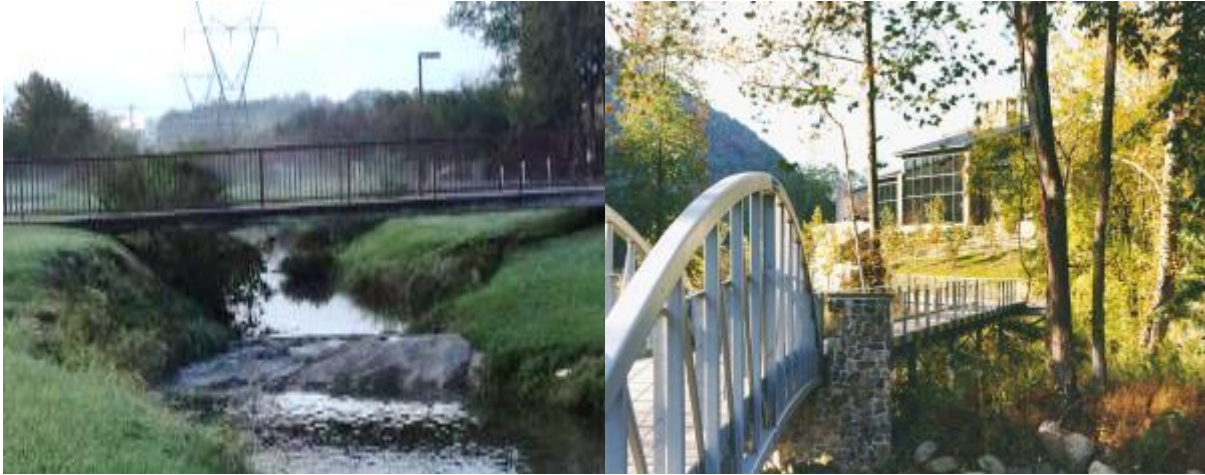
Figure 5.2.1.1-4. Bridges over valleys to facilitate access.