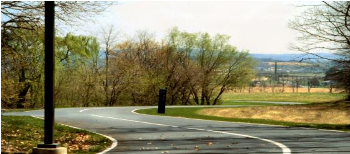
Figure 5.2.1.1-3. Design road alignments with topography.