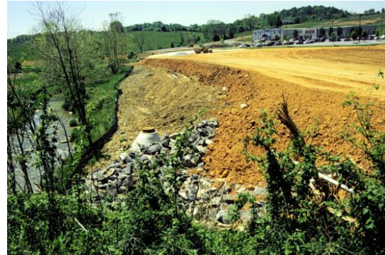
Figure 5.2.1.1-1. Clearing and grading a hilltop removes the ecosystem services inherent in undisturbed soils and vegetative cover.