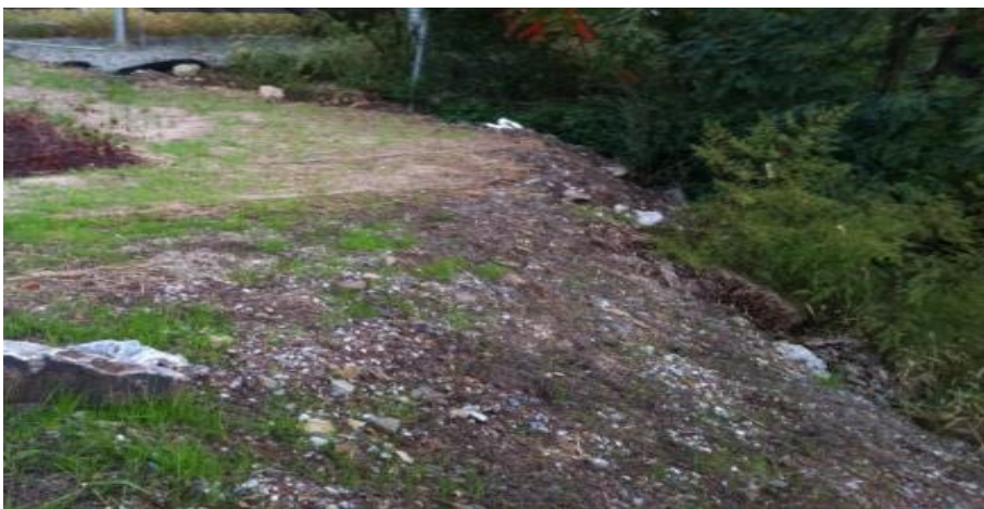
Figure 5.2.1.1-6. Example of abrupt transition between new and existing grade