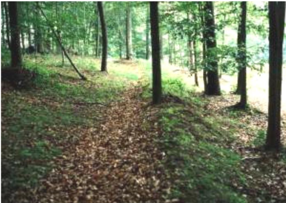
Figure 5.3.7-1. Infiltration berm constructed along the contour in a wooded area receives runoff from a large-lot residential area.

Infiltration berms are compacted linear mounds of earth constructed along contours that are used to reduce stormwater velocities and detain runoff volume on hillsides with gentle to moderate slopes. By creating gentle variations in the topography of a hillside, infiltration berms slow the flow of runoff to allow ponding on the soil surface and storage of runoff in modified soils or in a stone trench, and promote infiltration behind the berm. Infiltration berms can aid in slope stabilization and prevent erosion, add interest to uniform landscapes, filter pollutants in runoff, and create habitat. Infiltration berms are often referred to as retentive grading. Infiltration berms may be used in conjunction with vegetated swales (Section 5.3.5) or infiltration trenches (Section 5.3.3) to provide additional stormwater management.