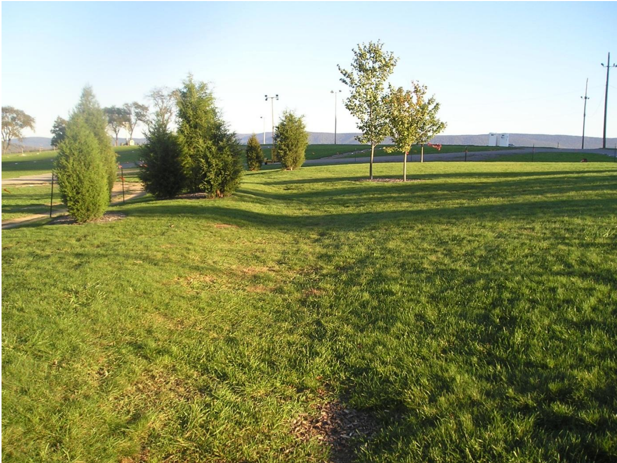
Figure 5.3.7-2. This berm is combined with an infiltration trench (BMP 5.3.3) to capture runoff from a grassed overflow parking area.