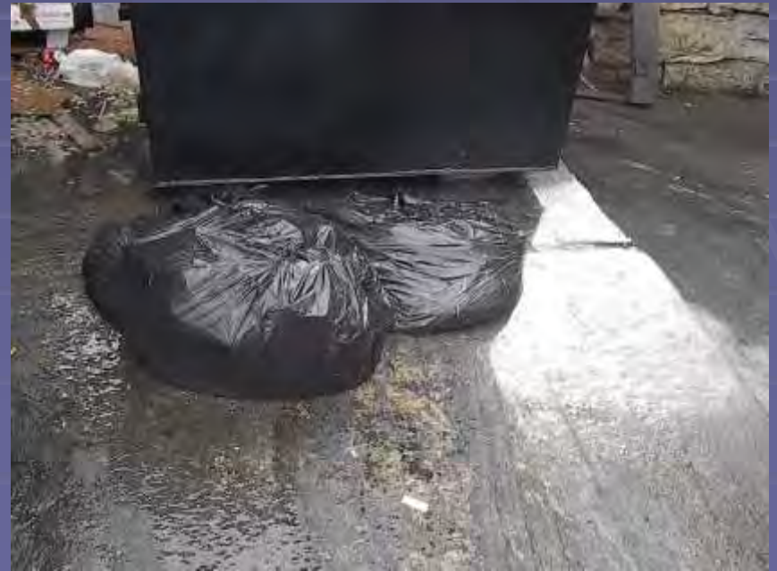
Grease Recycle bin impacts