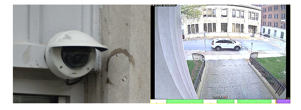
Exhibit 2: Location: Council Entrance (AXIS M3206-LVE Network Camera)

The oversight, performance and control of citywide camera management is mostly informal and based primarily on institutional knowledge of staff. The lack of citywide policies could hinder citywide camera management effectiveness.