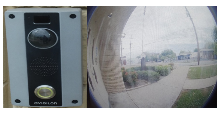
Exhibit 5: Location: Citywide Services Entrance (Avigilon Video Intercom)