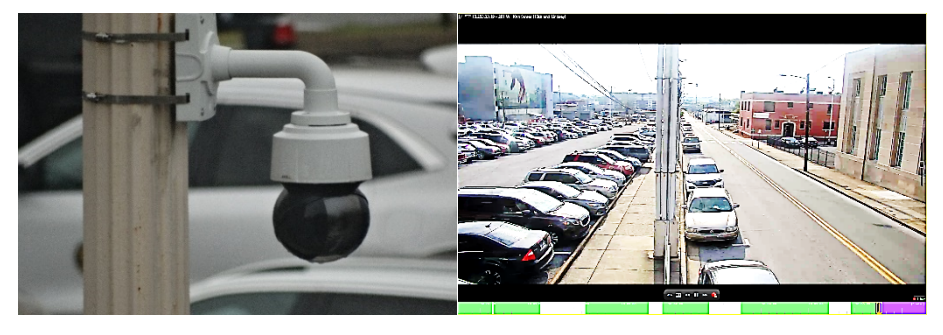
Exhibit 1: Location: 10th & Lindsay (AXIS Q6155-E PTZ Dome Network Camera)

The City of Chattanooga (City) maintains a system of cameras that are used for public safety, security, monitoring operations, and safeguarding property and equipment.