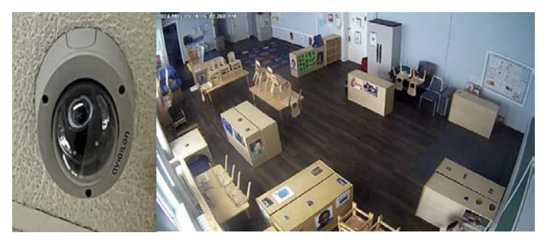
Exhibit 6: Location: Avondale Classroom 103 (Avigilon 3mp H5SL)