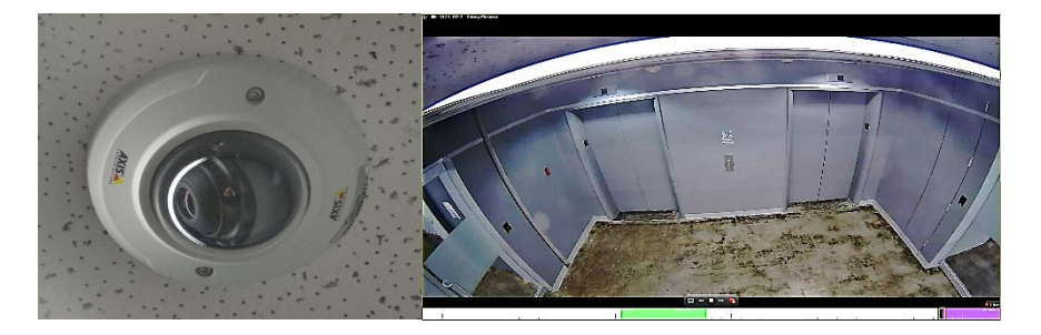
Exhibit 4: Location: Edney Building 3rd Floor Elevator (Axis M3046-V)